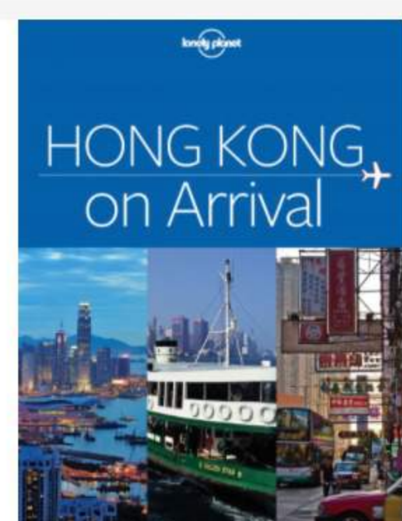
Book & Ebook

The capital region is buzzing with new cafes and restaurants opening every week. Here are some new and hip eating places