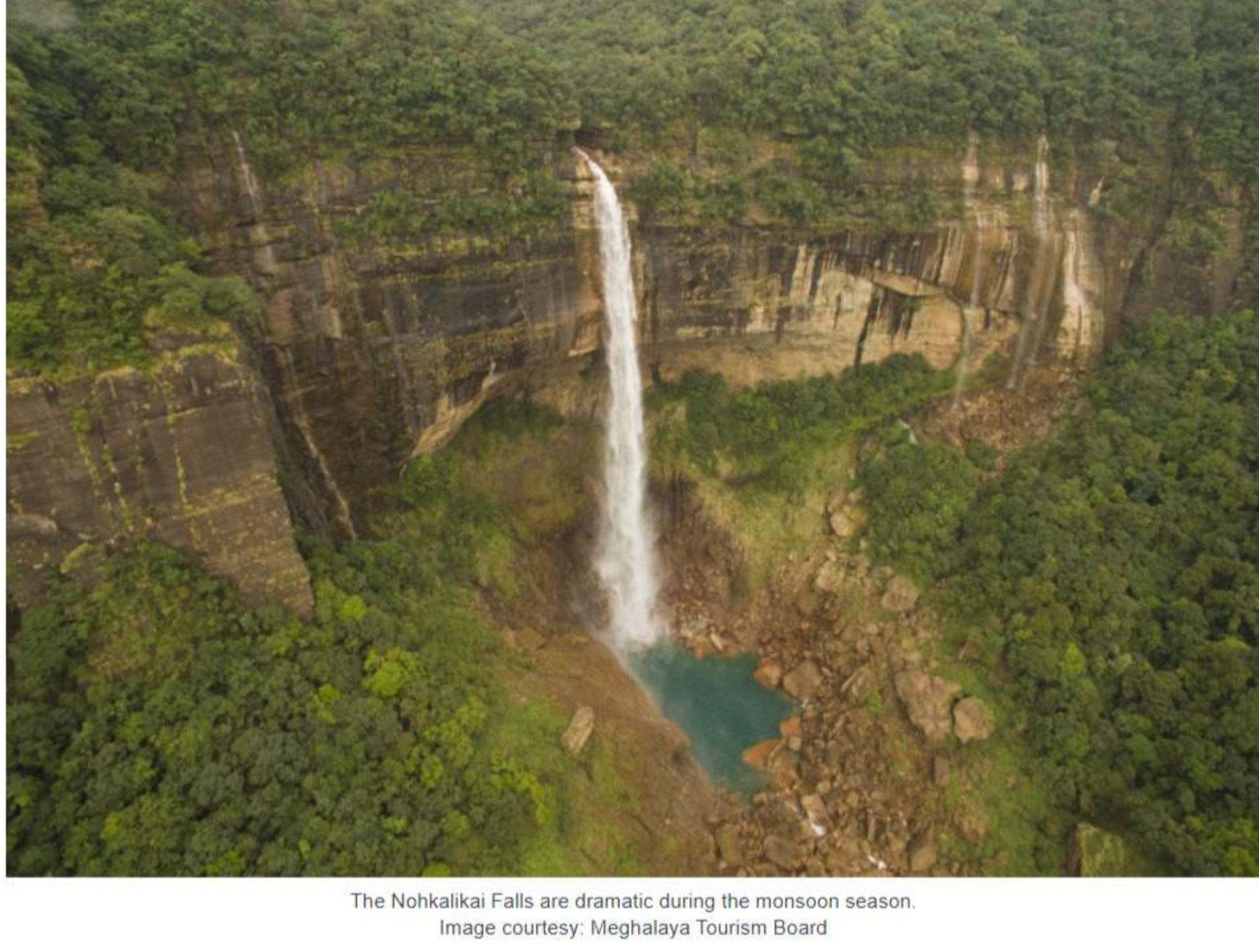
The Nohkalkai Falls are dramatic during the monsoon season.

Though the waterfall chasing in Meghalaya starts in Shillong itself with its stunning Elephant falls, it is the journey to Sohra that accelerates it. With her head poking out of the car window, my daughter could not stop gasping at every cascade that we crossed. Don't miss the stunning Nohkalkai falls that plummet down to a large boulder or the Seven-Sisters falls that flow parallel to each other. Take your kids to the Wha Khaba falls where you get to walk on those wet stones of the streams that converge into a mighty waterfall.