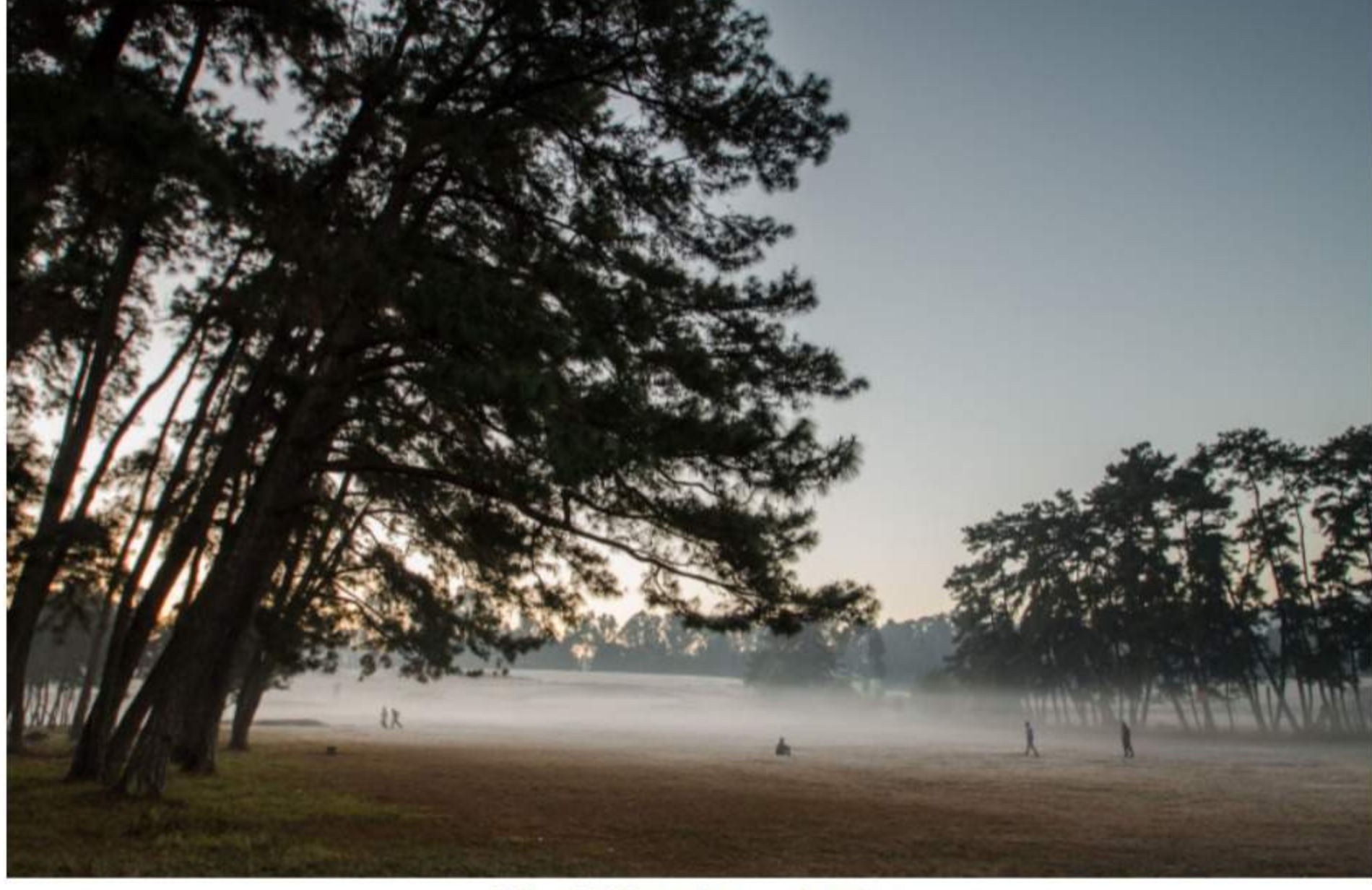
Shillong Golf Course has a scenic setting

A visit to the Shillong Golf Course is like going to the highlands of Scotland. You can see a huge expanse of green dotted by not just golfers, but by families, couples and friends spending time together and with local kids trying some acrobatics in the golf pits. You can even fly a kite.