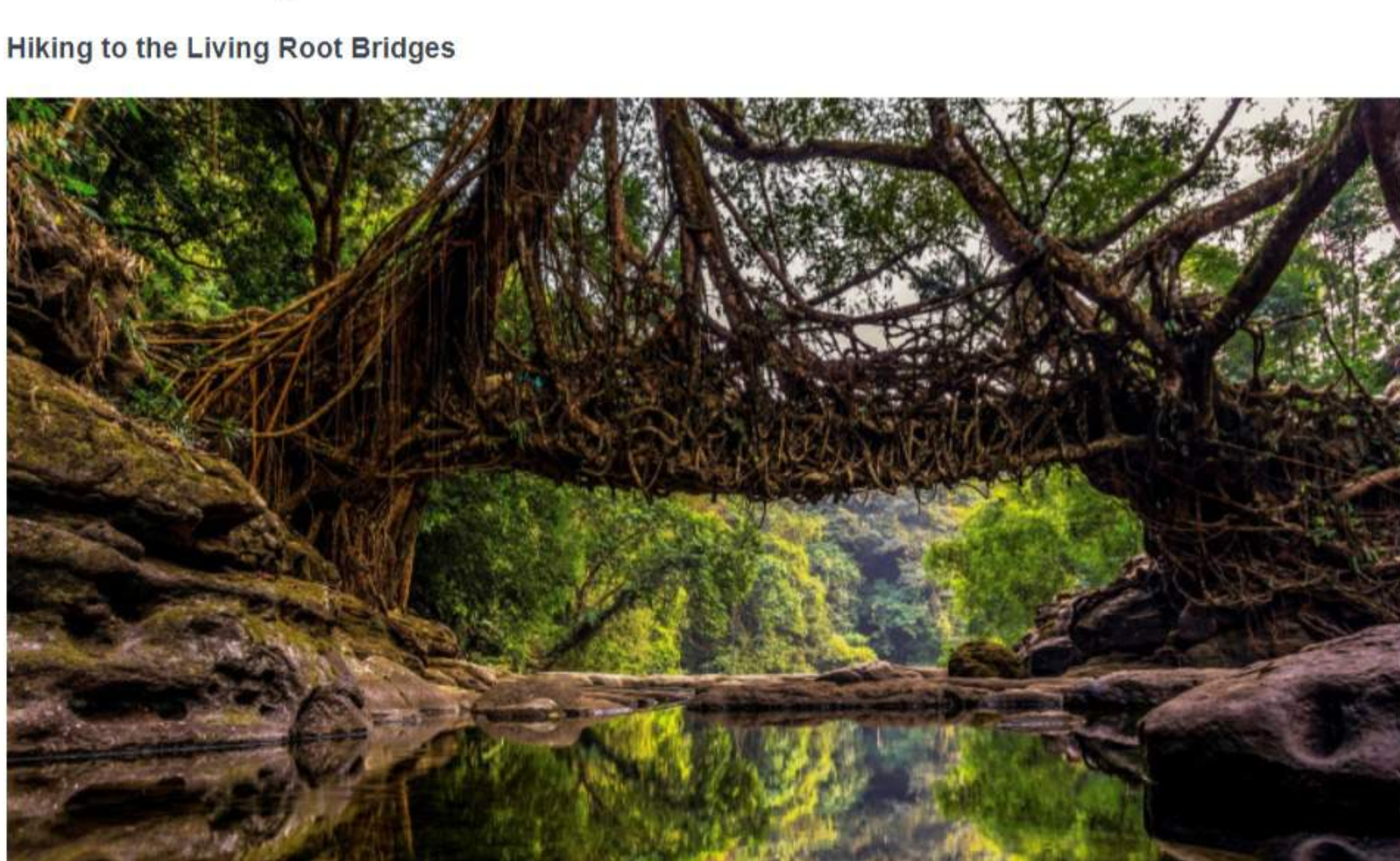
The unique Living Root Bridge

One of the most unmissable things in Meghalaya is its unique Living Root Bridges, a bio-engineering feat that few other places in the world can boast of. Made out of live, growing roots of the rubber tree, this bridge is not built but grown to make a sturdy crossing over streams and rivers. It is so strong that it can hold up to 50 people at a time. It is a lovely hike for adventurous families – especially if you opt to see the double decker Umshiang root bridge in Cherrapunji also. You can even visit the Living Root Bridge in Mawlynnong, especially if you are traveling with younger kids.