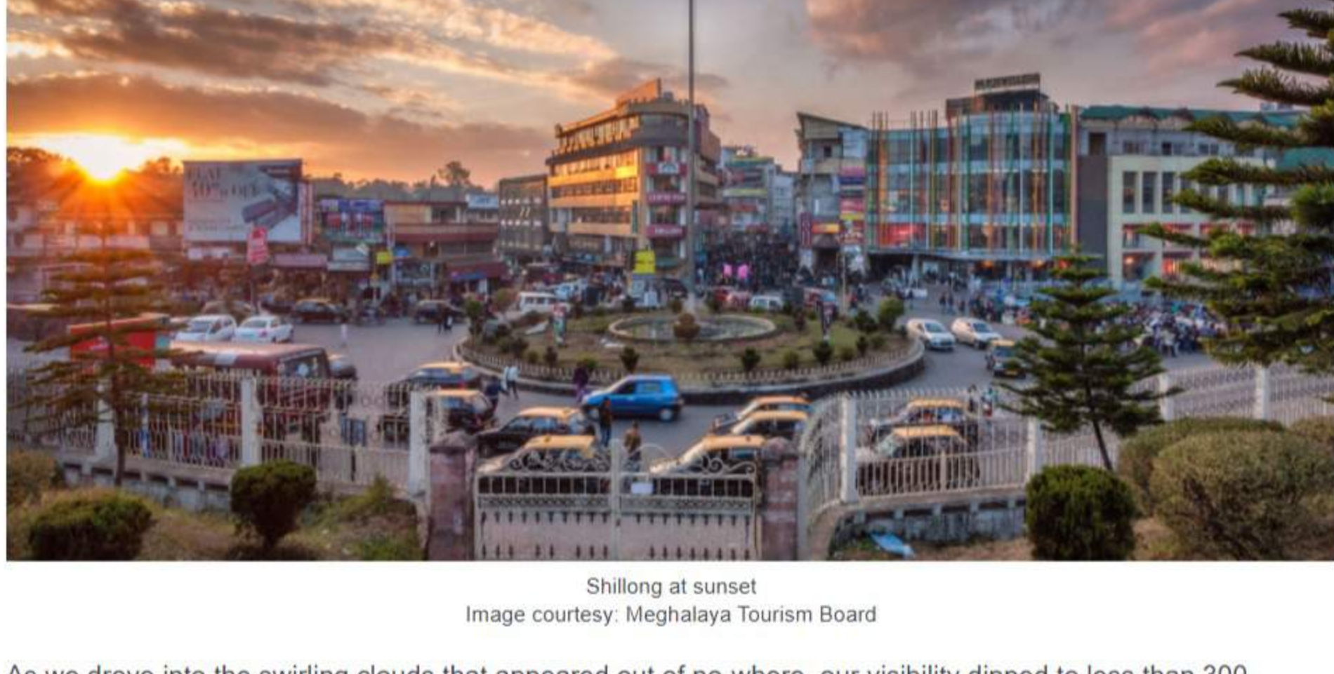
Shillong at sunset

As we drove into the swirling clouds that appeared out of no-where, our visibility dipped to less than 300 meters. I panicked and checked with our driver on whether we should stop till it cleared, but he just smiled and said – “relax, this is normal for we are in the ‘Abode of Clouds’”.