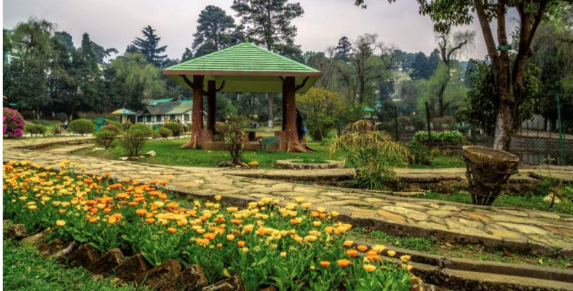
Lady Hydari Park also has a mini-zoo

With its unhurried pace of life and friendly people, well-maintained parks and the 80s music that blares out of restaurants and taxis, Shillong is charming. A walk in Wards Lake, with its British styled landscaping is a perfect way to start your day. The Lady Hydari Park also has a mini zoo with butterflies fluttering on the rare orchids here.