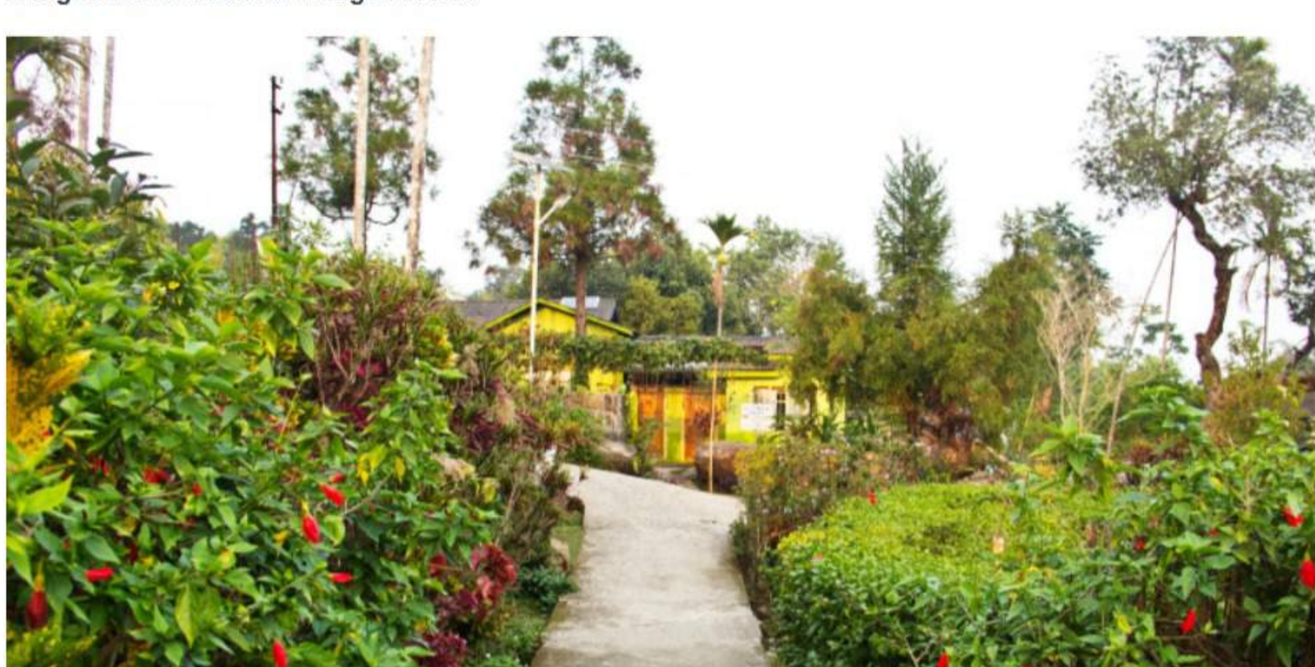
The pretty village of Mawlynnong

Visiting Mawlynnong, the cleanest village in Asia, is not enough. You need to spend a night here in home-stays and experience the hospitality of the Khasis. Interact with the locals, play with the children and climb up the lovely tree house to spot the neighbouring plains of Bangladesh as you enjoy the pristine and homely atmosphere of this village.