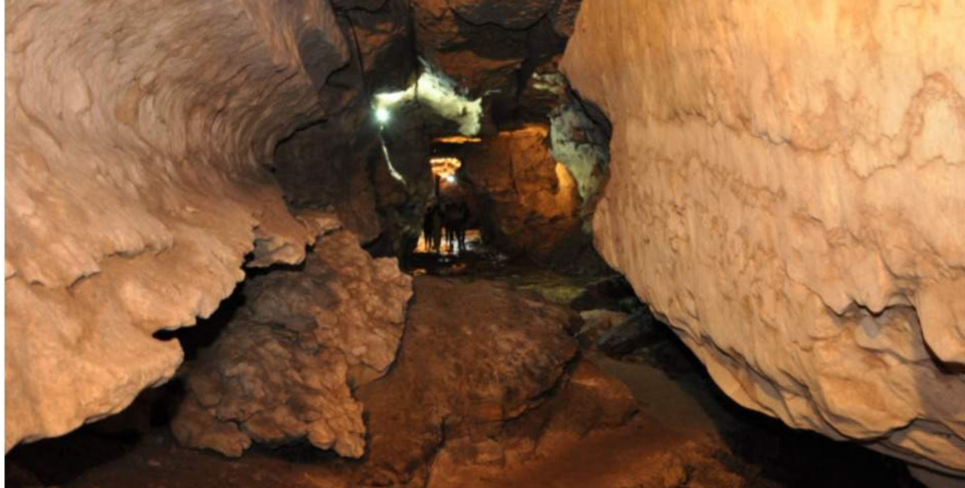
Caving is a popular activity in Meghalaya

Crouching along narrow passages and squeezing through crevices in torchlight with just the sound of streams entertaining you can be quite an adventure for adults and kids. While there are several caves that you can visit in Meghalaya, my personal favourites are the Anwai Caves and the Mawmai caves in Cherrapunji or Sohra. My daughter was thrilled to crawl through the dark spaces as water dripped over her face. She also spotted numerous fossils along the cave walls.