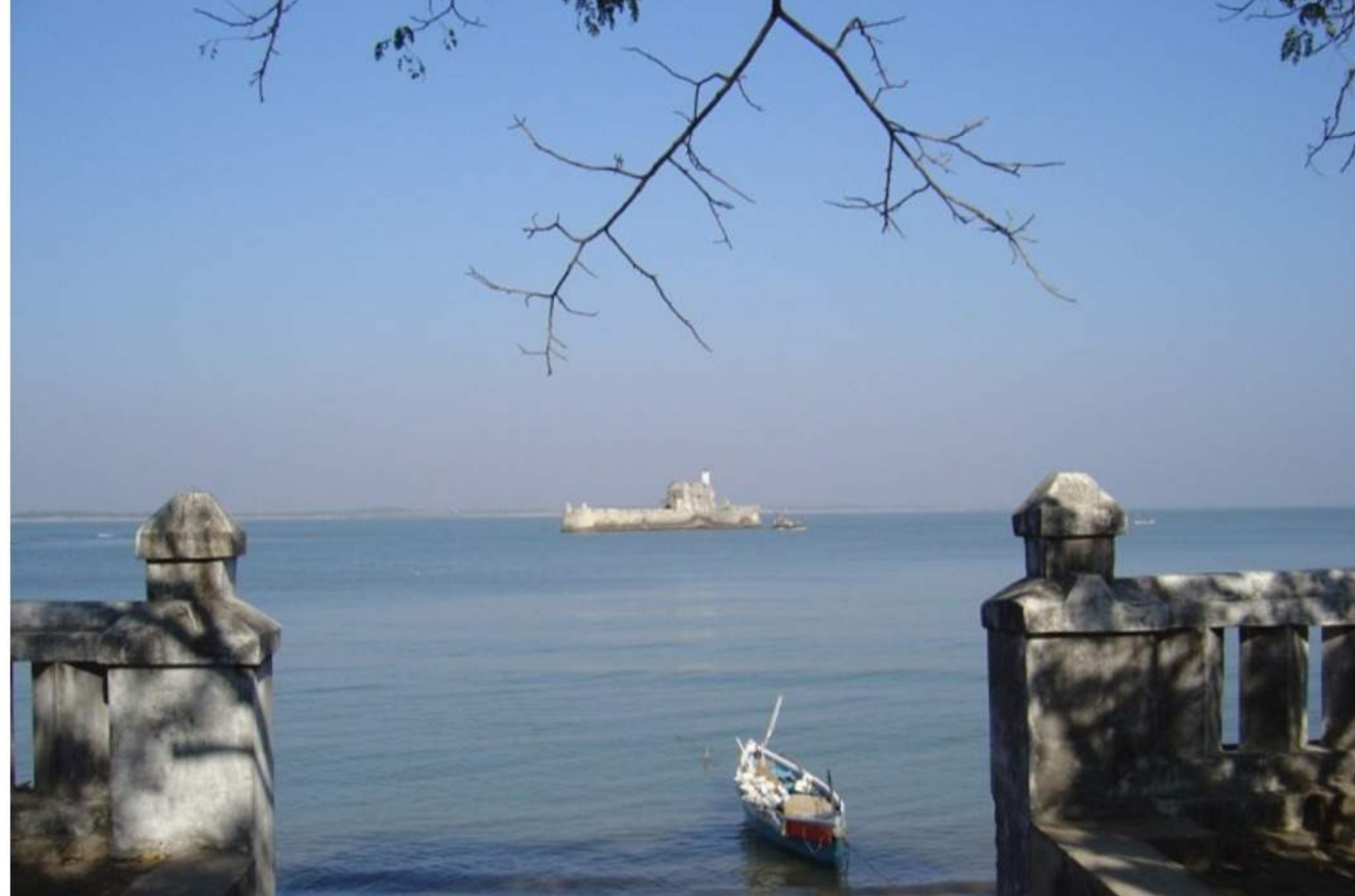
Daman Fort

A little bit of wildlife, some heritage and lots of beach time – both these union territories offer a lot to do. It's not just the combination of sun, sand and sea which makes them attractive. This ocean-swept enclave is a seamless mingling of cultures. It also offers delicious coastal food and cheap liquor. While away time at the beaches and explore the ancient Daman fort before taking a romantic sunset cruise.