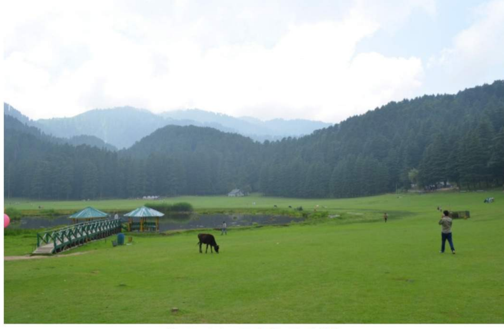
Khajjar is also known as the Switzerland of India.

Discover the Switzerland of India with its never-ending green meadows against the backdrop of the snow-capped Himalayas. Khajjar with its gorgeous landscape, adds colours to your photographs giving you beautiful memories for life. Here you will find that time frozen while you enjoy some golf, pay a visit to the Kalatop wildlife sanctuary or just trek around the Khajjar peak.