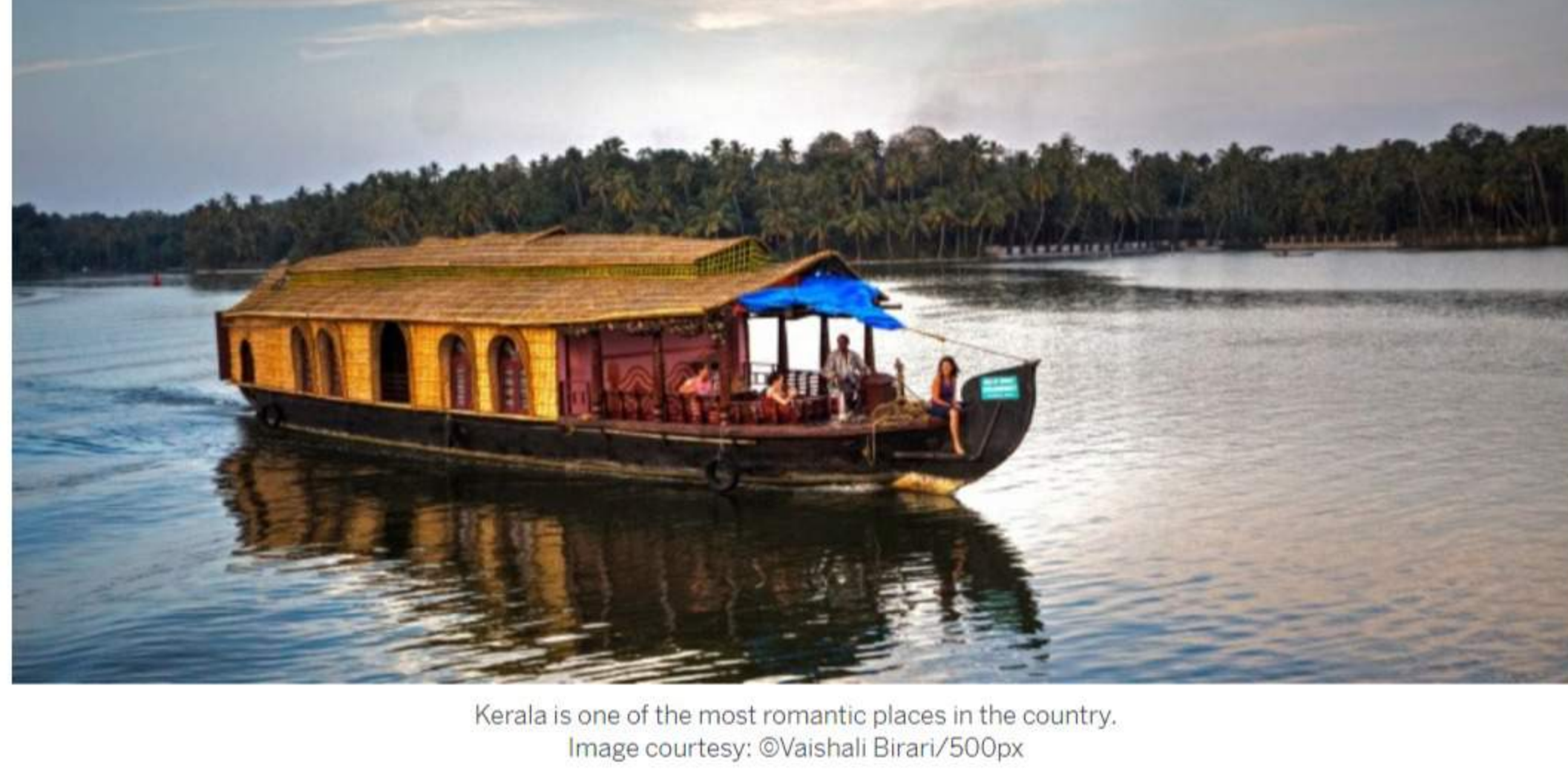
Kerala is one of the most romantic places in the country.

After the hectic wedding rituals are finally over, it's time to celebrate your marriage and go for the most romantic trip of your life – the long awaited honeymoon! It's a perfect escape and excuse for any newly-wed couple to relax, unwind, bond with each other and create some beautiful memories for a lifetime. These days many couples want to visit a place that's different, not too crowded and still offers a few interesting activities. Here are 10 such offbeat destinations in India that promise you just that.