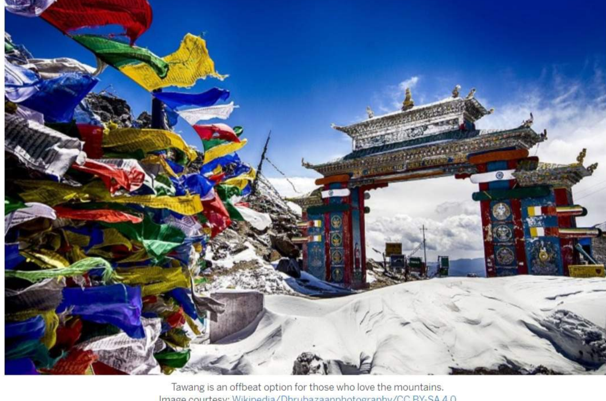
Tawang is an offbeat option for those who love the mountains.

One perfect place for couples who love mountains and nature is Tawang in Arunachal Pradesh. Experience the stunning cascade of water drop from over 100m at the Nuranang waterfalls while you take some pictures together at the picturesque Shonga-tser lake, complete with its mountainous backdrops. And if you are planning a winter honeymoon, you can even try some skiing at the Pankang Teng Tso Lake.