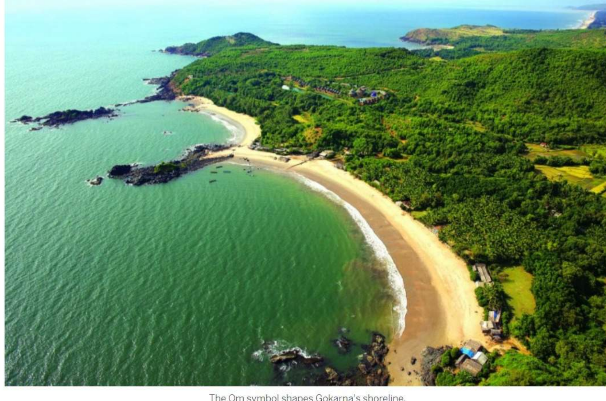
The Om symbol shapes Gokarna's shoreline.

With its serene atmosphere, rocky beaches and clear skies Gokarna offers you a quiet yet fun-filled honeymoon experience. A light trek from Kudle beach right up to Paradise beach – a combination of idyllic beach walks and a light hilly trek. Lie down on the moonlit Om beach to experience a gorgeous night sky while listening to the sounds of the waves lashing on the hills. And if you want more, there is always the plethora of beach adventure sports that you can try out together.