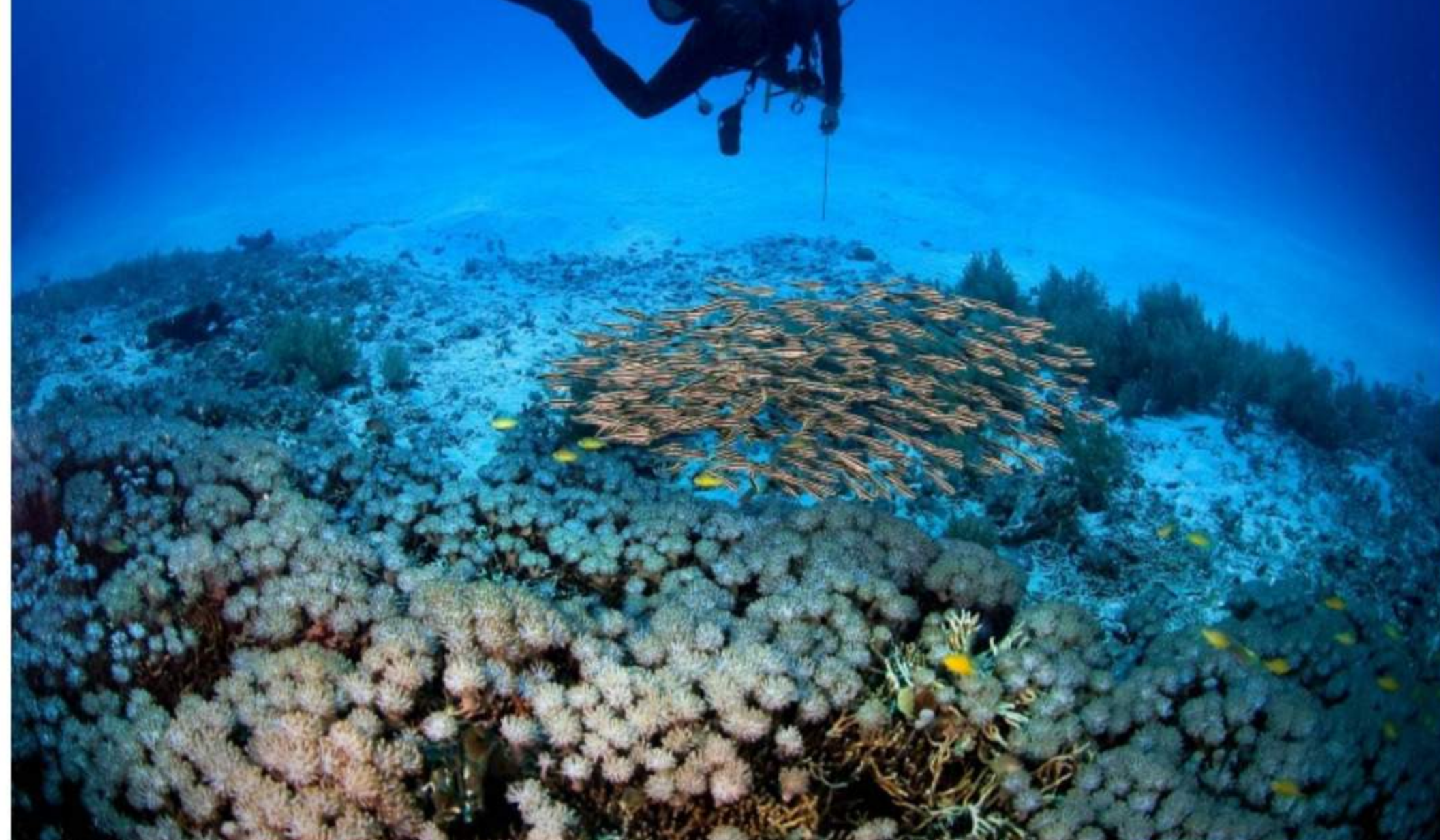
Scuba diving is a must in Lakshadweep.

Soak up a little sun along the uncrowded and pristine beaches of the Lakshadweep islands along with your partner. The crystal clear, blue lagoons surrounding the islands are a perfect place to try snorkelling, kayaking and go on glass bottom boat rides. The more adventurous couples can explore the colourful underwater corals and marine life with scuba diving. The islands of Lakshadweep promise you a luxurious and a memorable honeymoon.