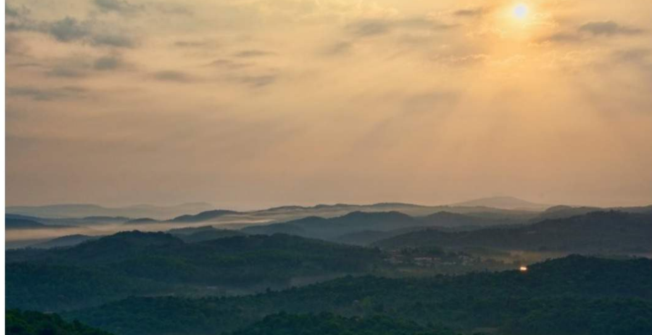
Covered with thick clumpy bushes of coffee, Coorg offers a refreshing green holiday.

The green hills of this coffee county are perfect for a honeymoon in any season. Coorg offers you a dash of adventure, wildlife and loads of nature. Try some tiger spotting in Bandipur or spend some idyllic time at the various waterfalls and viewpoints around Coorg. If you love some adrenaline thrill, head to the Barapole river for an amazing session of river rafting.