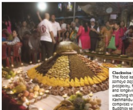
Clockwise from left: The food items in the samaya baji represent prosperity, fortune, wealth, and longevity; Onlookers watching the festivities; The Kathmandu Durbar Square comprises various Hindu and Buddhist temples.