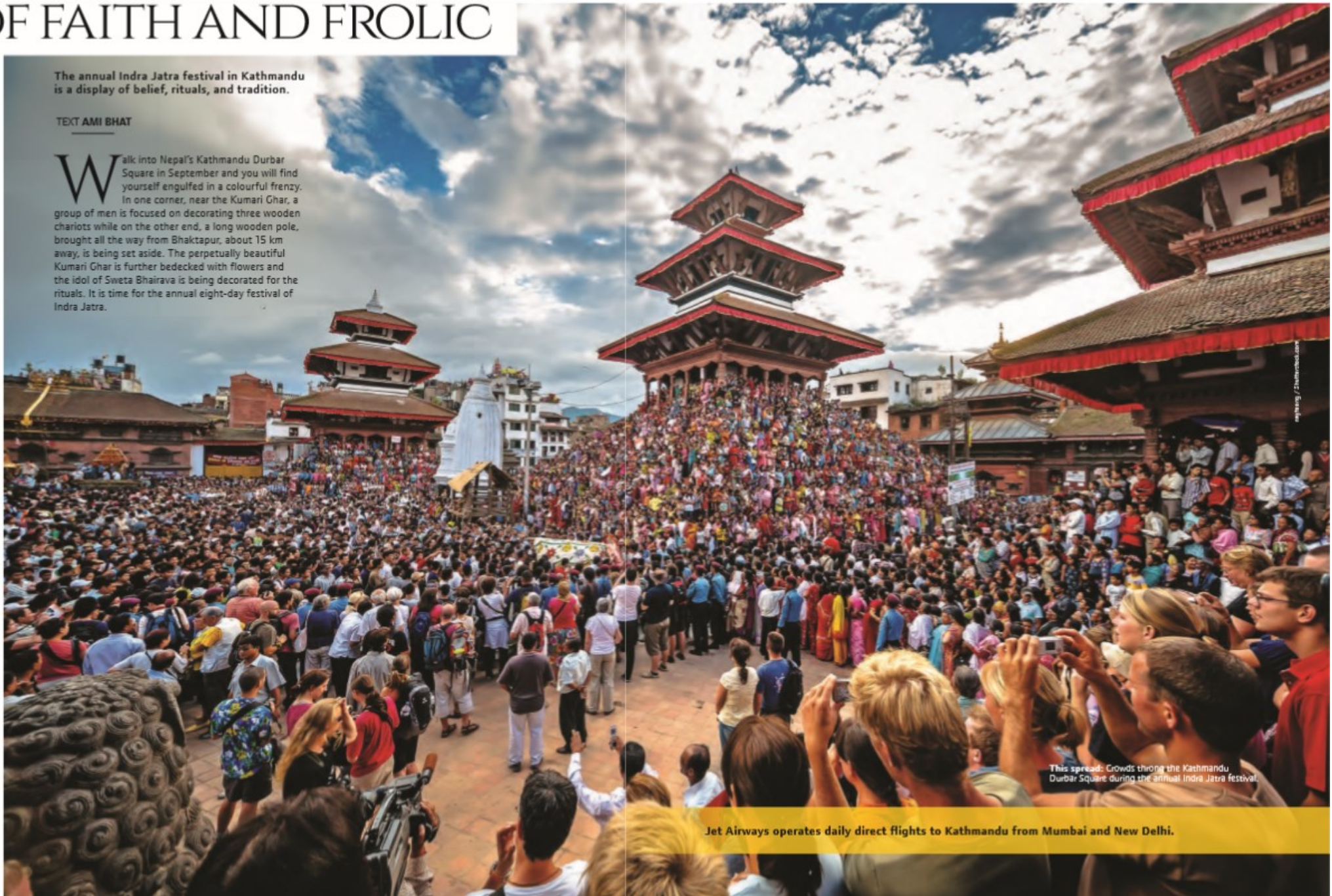
This spread: Crowds throng the Kathmandu Durbar Square during the annual Indra Jatra festival.

Walk into Nepal's Kathmandu Durbar Square in September and you will find yourself engulfed in a colourful frenzy. In one corner, near the Kumari Ghar, a group of men is focused on decorating three wooden chariots while on the other end, a long wooden pole, brought all the way from Bhaktapur, about 15 km away, is being set aside. The perpetually beautiful Kumari Ghar is further bedecked with flowers and the idol of Sweta Bhairava is being decorated for the rituals. It is time for the annual eight-day festival of Indra Jatra.