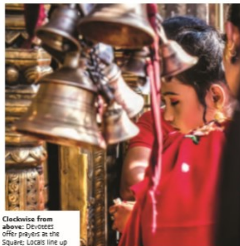
Clockwise from above: Devotees offer prayers at the Square; Locals line up the streets with butter lamps to honour their ancestors; Indra Jatra is marked with traditional music and masked dance performances.

A beloved son, Lord Indra descended to Earth in search of the rare Parijata flower for his mother. Unfortunately, the locals mistook him for a petty thief and hung him on a pole as punishment. Worried about his absence, his mother came down looking for him and found him in this state. After revealing her identity, Lord Indra was released and he returned to his heavenly abode. The Indra Jatra festival, over eight days, celebrates the Lord's descent and blessings in the form of rain that the mother bestowed on them. Over the course of the duration of the festival, you can relive the legend.