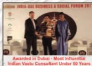
Awarded in Dubai - Most Influential Indian Vastu Consultant Under 50 Years